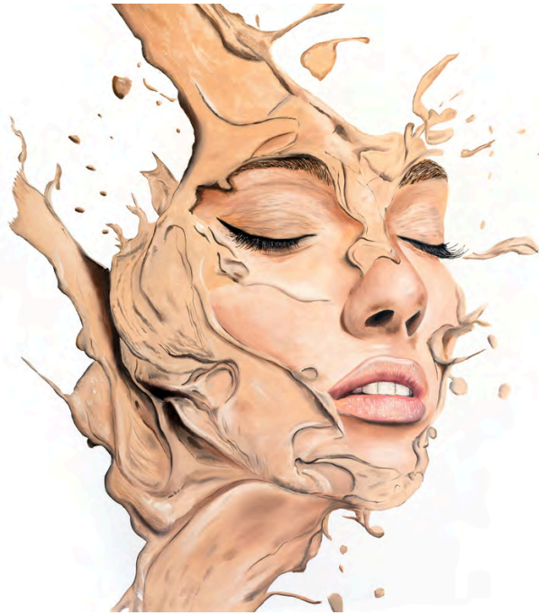
Between structure and authenticity – Oil on canvas, 120x120cm, 2024

I hope that something shifts within them. Many people go through life without truly living the way they want, held back by societal expectations of success, money, and reputation. My goal is to inspire viewers to reconnect with themselves, to question what truly fulfills them, and to pursue their own path with courage. If my art sparks even a small realization in someone—an urge to change, to grow, or to see the world differently—then I have achieved my purpose.