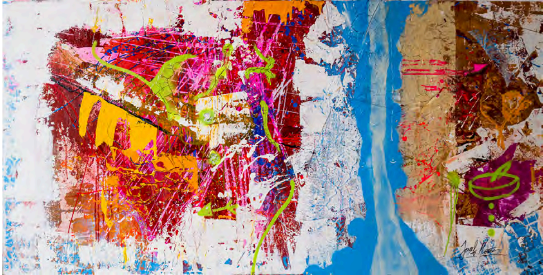
Temper Tantrum Chic Oil & acrylic on canvas, 90x180cm, 2024

"Temper Tantrum Chic" is a work that presents emotions in their purest and unfiltered form - not tamed, but consciously unfolded. The bold reds and vibrant accents of yellow and pink symbolize the intensity of inner turmoil, while the cool blue creates balance, like a silent observer in the midst of a storm. It's a metaphor for the way we deal with strong emotions: a dance between control and the uncontrollable flow of the moment.